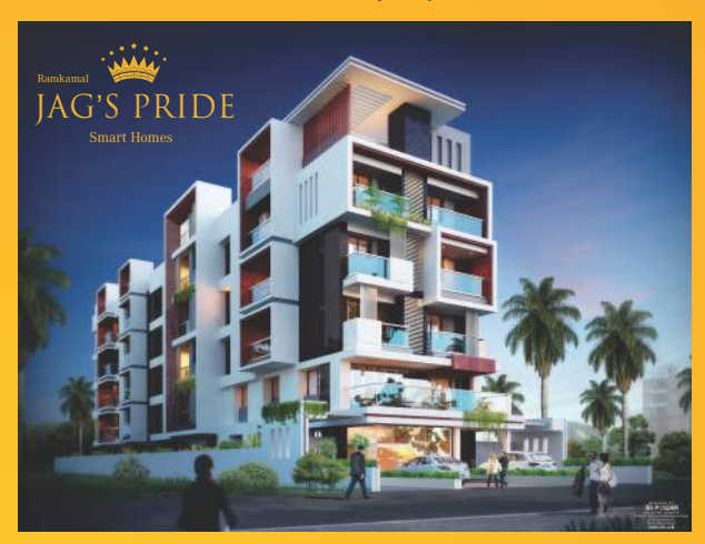
Manjakuppam, Nethaji Road, Cuddalore